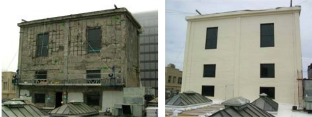
Full day workshops on Anti-Corrosion techniques, 2016