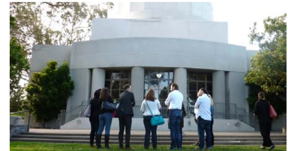
Tour of recent landmark rehabilitation to meet life-safety & accessibility codes and conservation of murals.