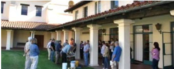
Tour and hands-on demonstration of preservation work.