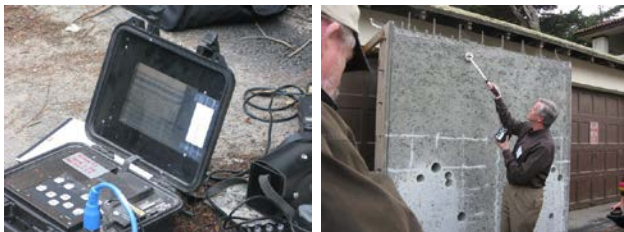
Radar Reading Device Metal detection of rebar inside wall