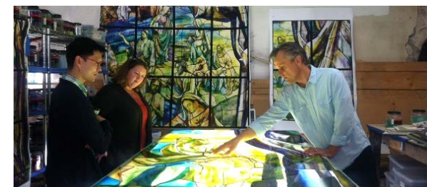
Tour art glass manufacturing and conservation studio.