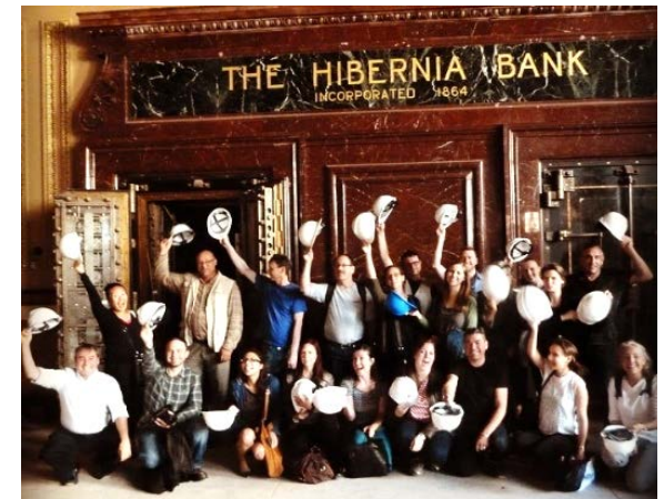
Hard hat tour to learn about innovative structural strengthening systems used in building rehabilitation.