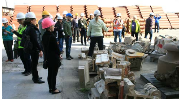
Exclusive tour and demonstrations of terra cotta manufacturing process, 2015 AGM in Sacramento, CA.